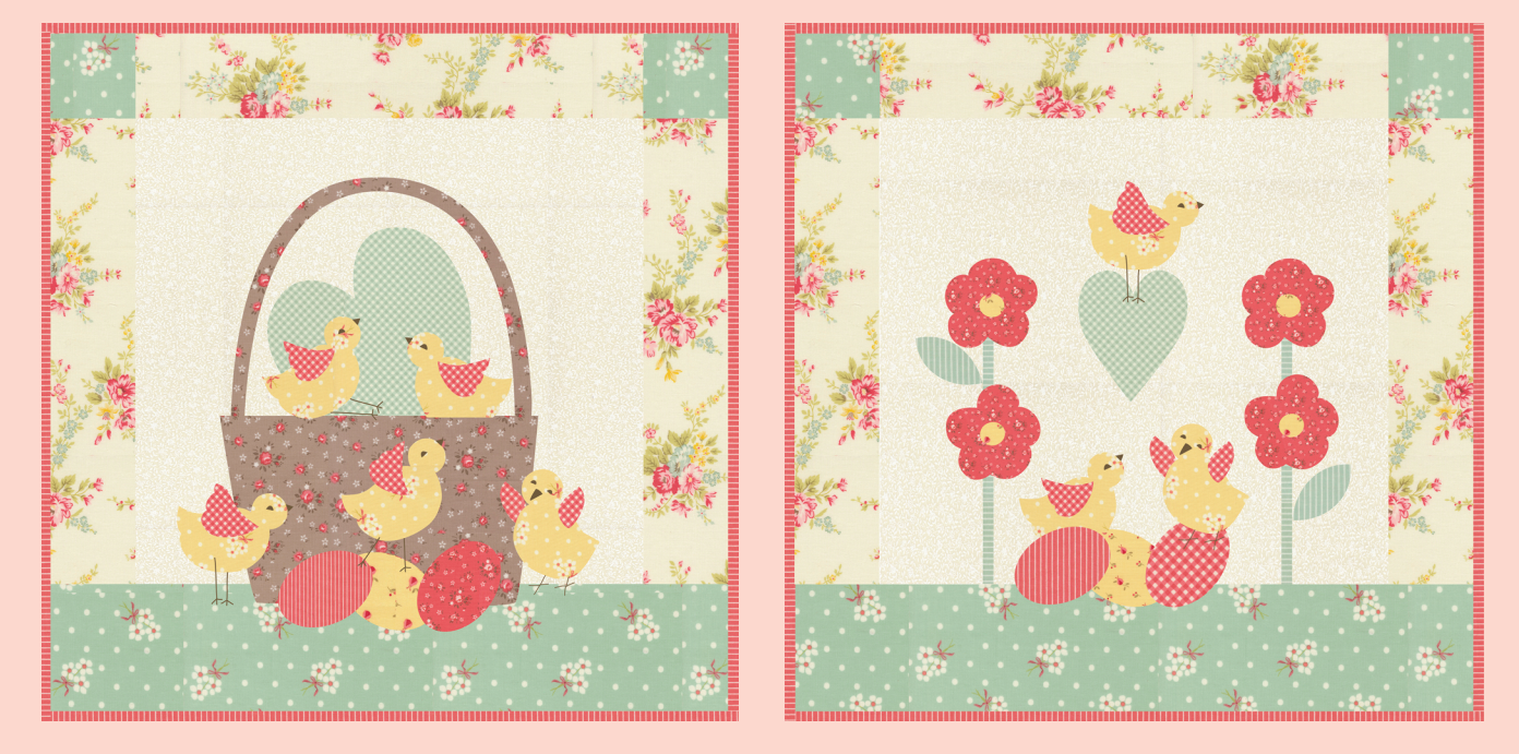
BHD 2212 Here a Chick, There a Chick - 2 mini quilt patterns 16" x 16"